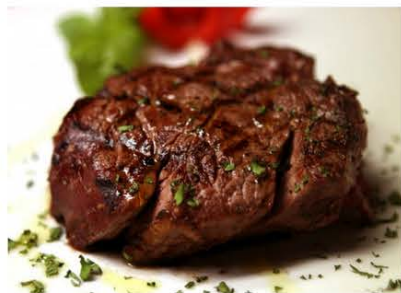
200g EYE FILLET

Showcasing the robust flavour of pasture fed beef and the tenderness of grain fed, served with steamed vegetables & creamy garlic mash.